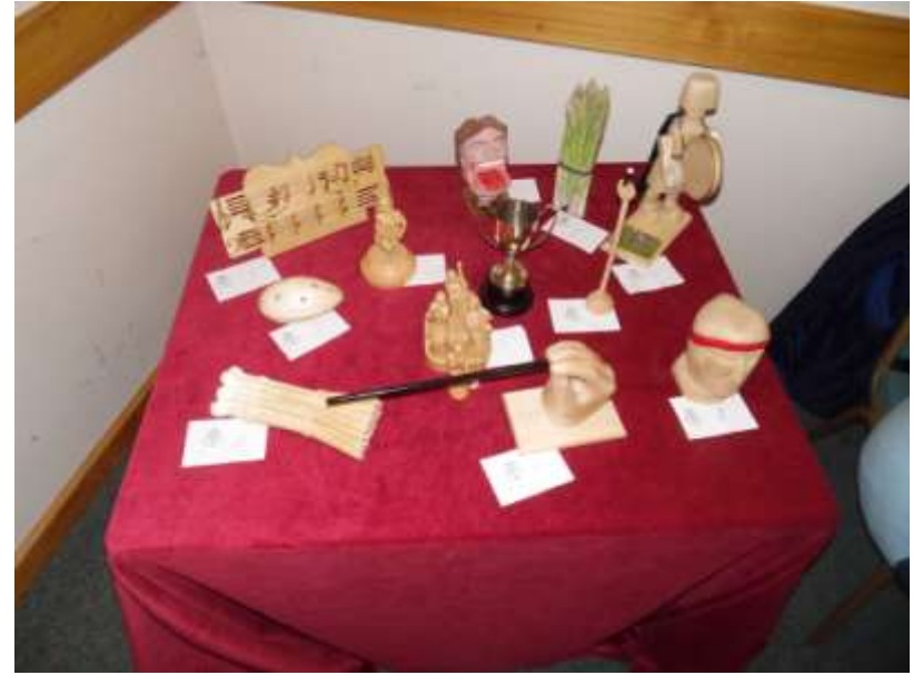
The eleven entries

draw which was made a bit more interesting in that every prize was gift-wrapped and so you didn't really have much idea what you were getting - I just looked for something vaguely bottle-shaped. So that was it for another year - roll on 2020.