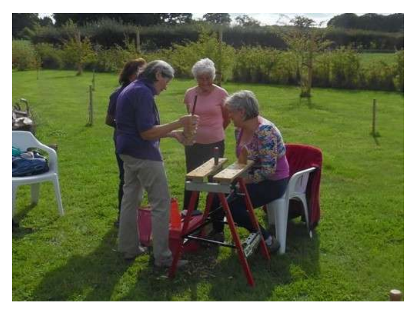
This is how you do it.....