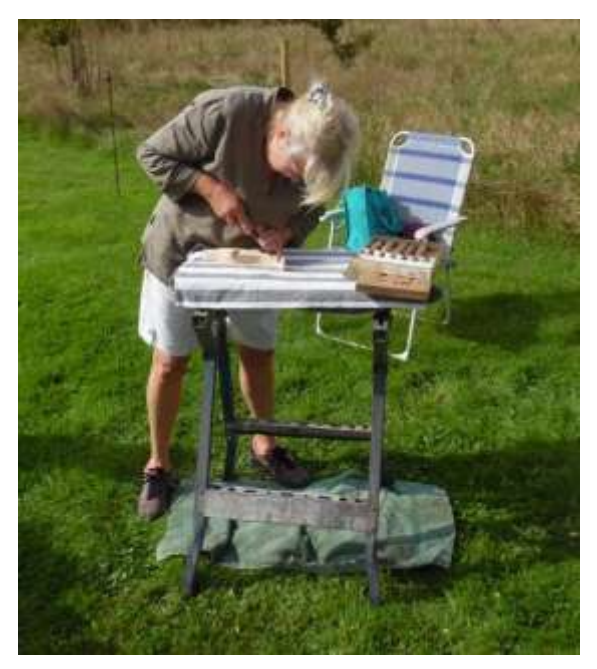
Dot deep in concentration