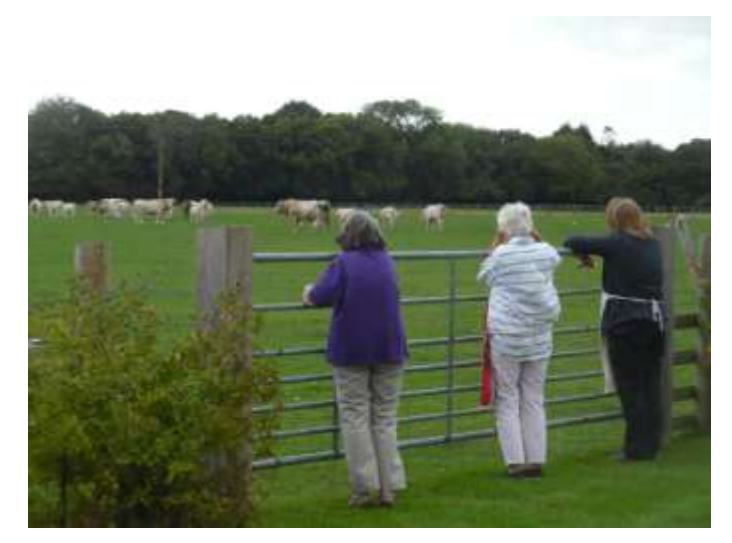
Admiring the prize bull