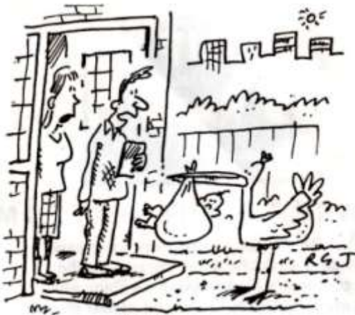
"Amazing what you can have delivered to your door now"