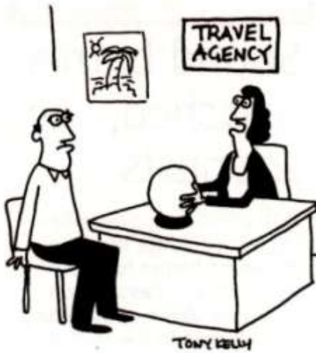
"We've updated all our equipment"