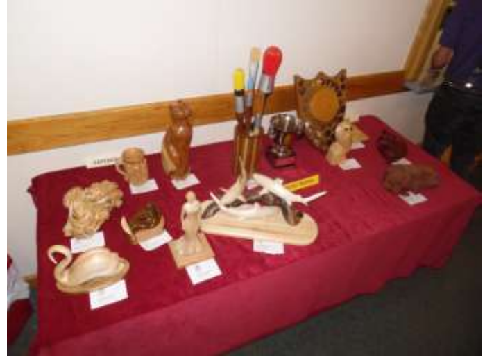
Club Trophy entries