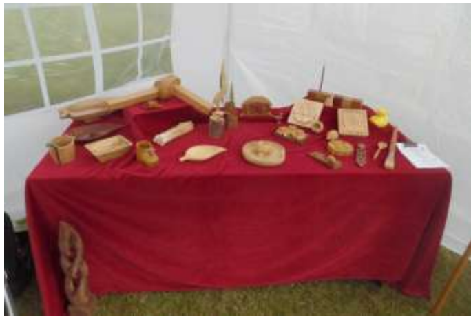
The touch table

We had a steady stream of visitors keen to chat about our craft and, who knows, maybe some future members. We were sure to tell them about our upcoming exhibition in Purlieu so that they could see a much greater range of our work. We even had a visit from our local MP Julian Lewis.