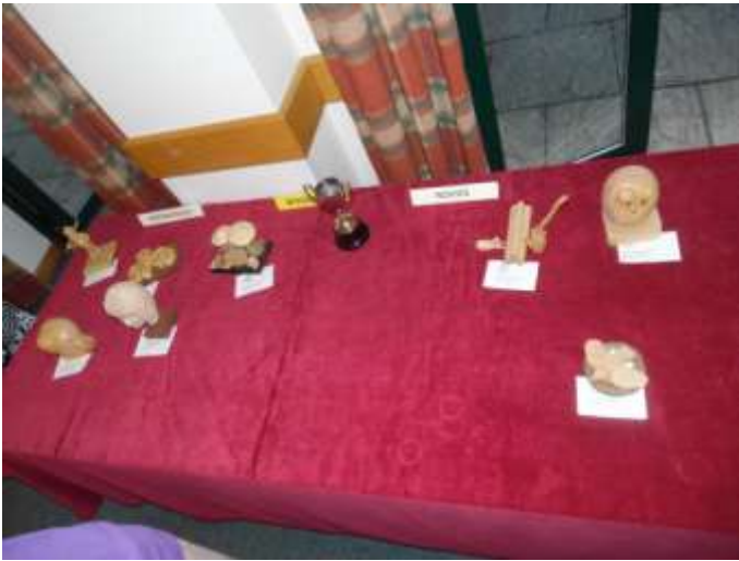
Woodblock Challenge entries