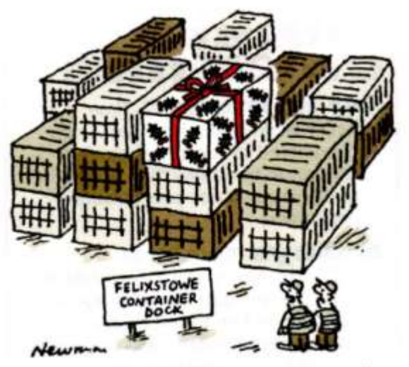
"That one's full of Christmas presents"