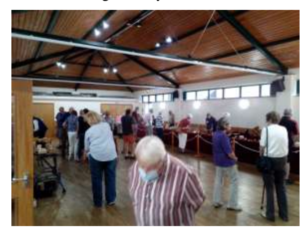
Plenty of interest

I think all involved had a great time and thanks to everyone for all the effort put in.