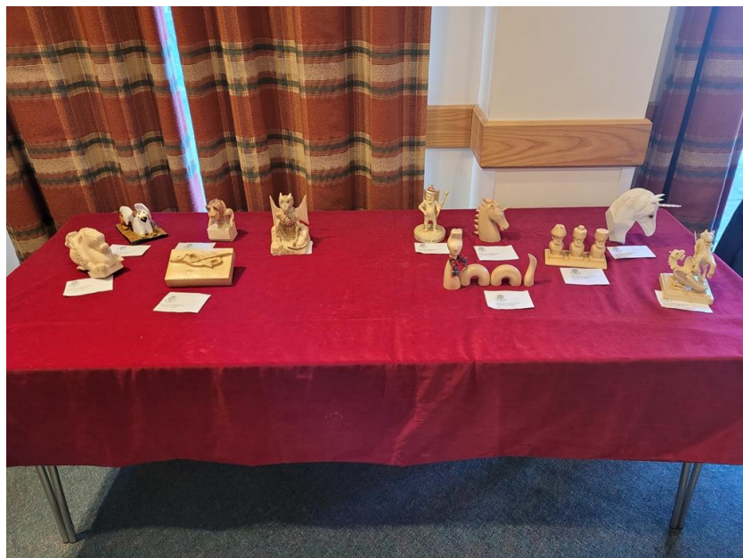
All the Entries