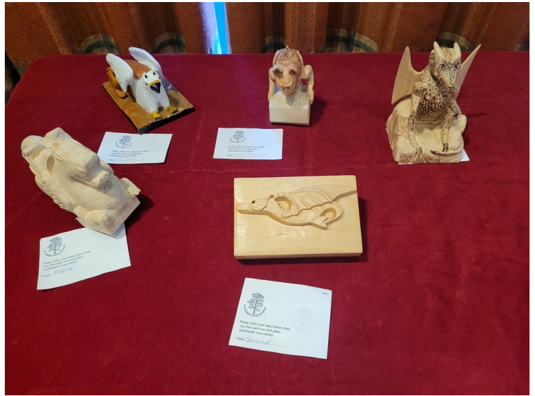
The Novice Entries