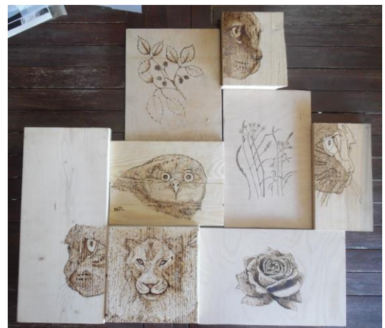
A good afternoon's work