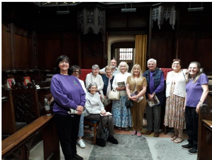
Our merry group