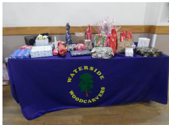
A chance to show off our new table cloths